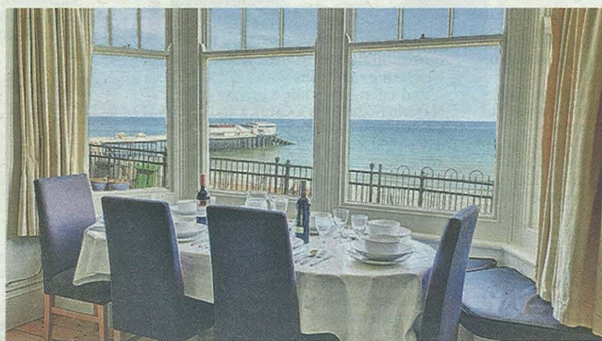
Pier pressure Left and below, Two The Crescent is on the seafront in Cromer. Bottom, the eye-catching bathroom at Yarrow Cottage, in Churchill

are this year's highlights), Cromer is a happy vestige of glory days by the seaside. It's also a good base for exploring the wilds of north Norfolk, but you need a suitably classy place to stay. Try Two The Crescent: an elegant yet family-friendly Georgian property, bang on the seafront. It has a posh kitchen and is minutes from Galton Blackiston's gourmet chippy ( nolcromer.com ). Sleeps 11; from £995 a week; 01263 715779, norfolkcottages.co.uk